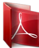
2014 Release Notes