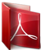
ICD-10 Companion Guide

If you have questions about any of these areas, please see the ICD-10 Companion Guide and 2014 Release Notes. Click on the Adobe icons below to obtain a copy of either document.